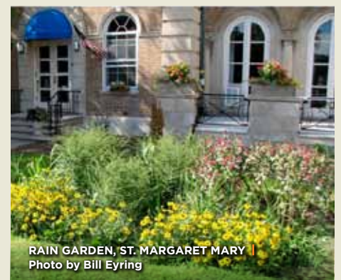
RAIN GARDEN, ST. MARGARET MARY | Photo by Bill Eyring

In Milwaukee, Green Infrastructure is even being used to protect beaches from road and parking lot runoff.