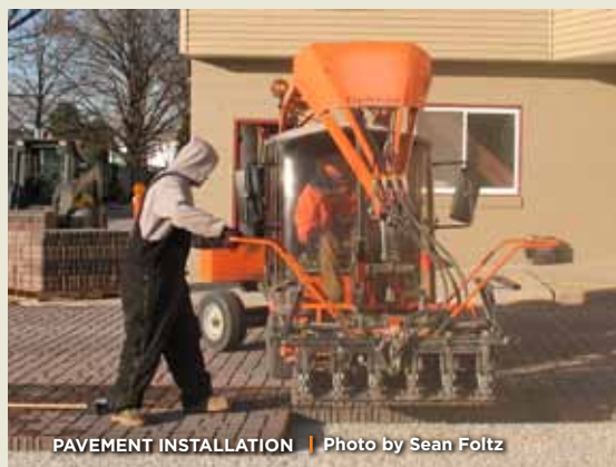
PAVEMENT INSTALLATION

Permeable paving blocks being installed in Milwaukee, WI.