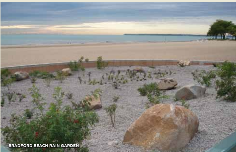
BRADFORD BEACH RAIN GARDEN

From the Northwest to the Great Lakes, green infrastructure is a proven tool in managing runoff and protecting our rivers and lakes.