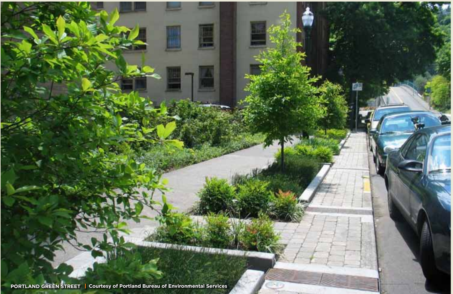
PORTLAND GREEN STREET

From the Northwest to the Great Lakes, green infrastructure is a proven tool in managing runoff and protecting our rivers and lakes.